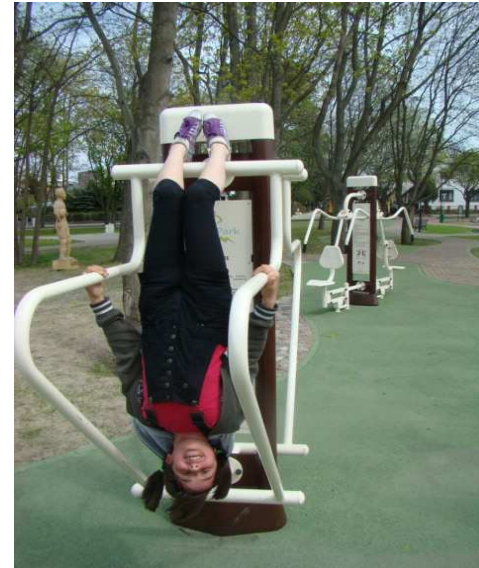
Park Tysiąclecia (Millenium Park)